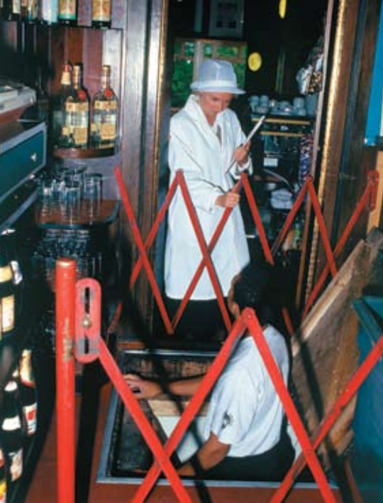
Occupational Health & Safety Enforcement