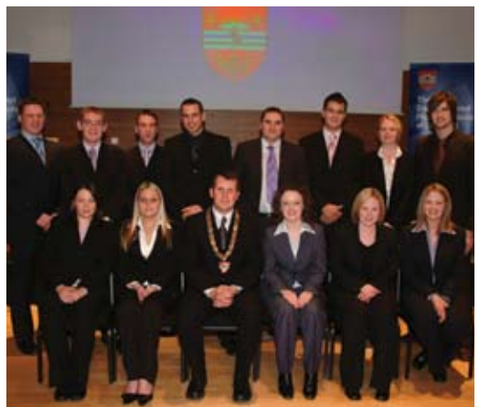
Annual Awards Ceremony

On passing the professional examinations, you will be awarded the REHIS Diploma in Environmental Health and become an Environmental Health Officer.