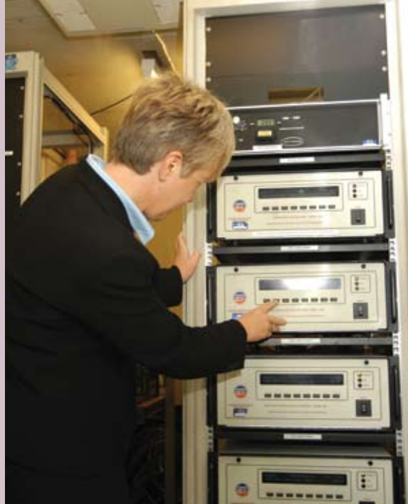
Air Quality Monitoring