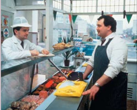
Food Safety Enforcement