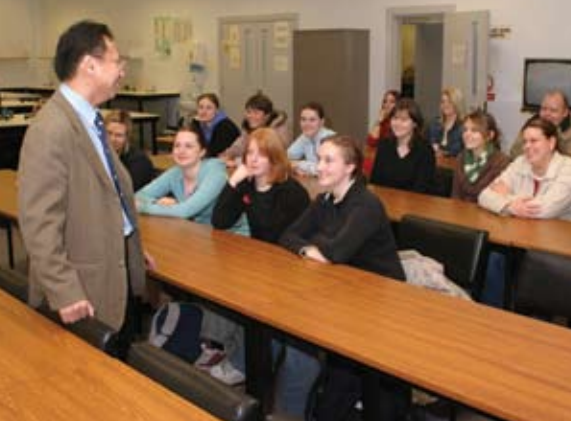
Teaching at the University of Strathclyde