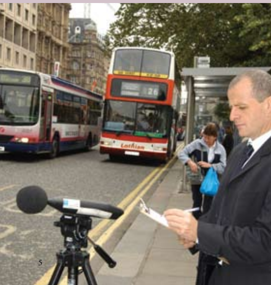
Environmental Noise Monitoring

You must register with REHIS at the commencement of your practical training.